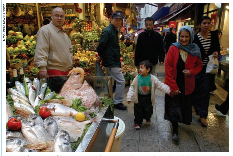
Turkish family and Chinese tourists shop in a produce market in Istanbul, Turkey, Nov. 5, 2007. That day the EU enlargement commissioner presented the latest annual report on Turkey's progress toward EU membership. The EU condemned Turkey's failure to address human rights issues and many other needed reforms.

Similar arguments are made about European defense cooperation. European governments split over the U.S. invasion of Iraq in 2003—a division often referred to, in the words of U.S. Secretary of Defense Donald Rumsfeld (2001–2006), as a rift between "old Europe" and "new Europe." This is widely viewed as undermining the coherence and effectiveness of European diplomacy vis-à-vis the U.S., and