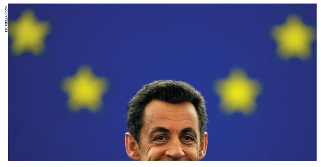
French President Nicolas Sarkozy in the plenary room of the European Parliament as he prepares to address the assembly in Strasbourg, France, on Nov. 13, 2007.

n its 50th year, European integration has established itself as one of the most remarkable international developments in modern times. A half century ago, who would have believed that Europe – and, at its heart, hereditary enemies France and Germany-would sponsor the single most successful voluntary international institution in human history? In two generations, European integration has not only contributed to economic growth and political stability first in a post-World War II Europe and more recently in a reunited post-cold-war Europe, but it has fundamentally altered the way Europeans think about national sovereignty and national identity.