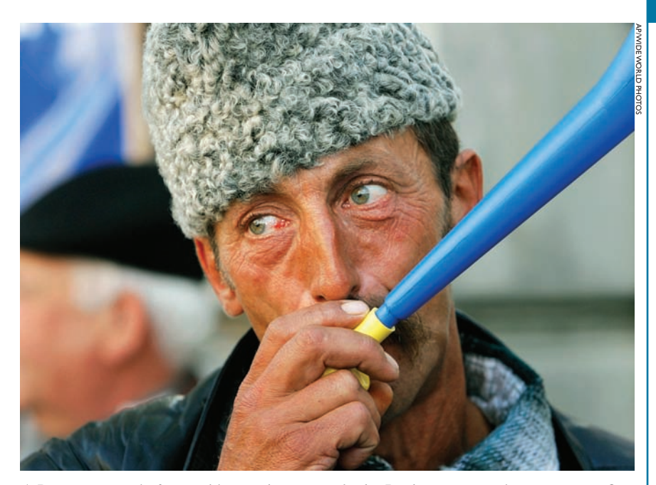
A Romanian cattle farmer blows a horn outside the Bucharest agriculture ministry, Oct. 23, 2007, during a protest demanding higher subsidies. EU officials have warned Romania that it must improve controls and auditing of where EU aid is spent or risk a 25% cut in handouts next year.

Supporters of current arrangements respond that Europe's major economic problem is inadequate labor flexibility and high pay. Hence budgetary austerity, cuts in social spending and wage restraint are necessary to maintain European competitiveness. Deregulation is what Europe needs most. Moreover, for these supporters of a less-democratic Europe, wage bargaining and true social welfare on a single European scale are, for the moment, unthinkable. To be